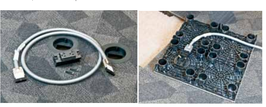
UL Approved power cables and outlets are snapped together and placed on the floor. The outlets get snapped into place and cable is buried under the floor. If an outlet location needs to be changed, simply lift the outlet up, move it, and bury the cable back into the floor. No special tools required. No special labor required. Nothing wasted.