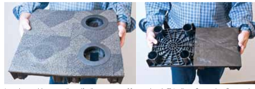
Interchangeable carpet tiles self-adhere to a set of four pedestals. This allows flex, so they float on the floor without laser leveling. Universal outlet ports for power, data, AV or pass-thru may be located in any of the pedestals. Pedestals are 3" high, providing a generous cable way capacity. Weight capacity tested to 40,000 lbs for each pedestal. 20 US tons.

Engineered for the purpose of routing power and data from the building to the computer user in a classroom, conference room, training room, office, or collaboration space. UL Approved power cables and outlets simply snap together. The whip gets installed to the service box by a licensed electrician, but the many outlets in the room are installed by the furniture installers.