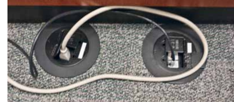
Power and data outlets are universal and interchangeable with the ports in the floor. Locate power and data anywhere in the room. Move them anywhere in the room. You can even pick up the floor and move the room. Take it with you to a new facility.

Get FFIT to be flexible. The SMARTdesks® FFITness Program is a great workout for your space!