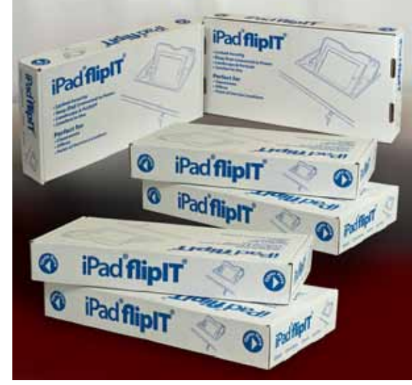
iPad flipIT Kits® have black lids and metal parts. When specifying iPad flipIT® for installation, all-black is the finish standard.

iPad flipIT® makes iPad classrooms safer places. No fear of dropping the iPad, knocking it off of a simple stand, or fiddling around with a folding case. The steel enclosure gives access to all controls and allows the USB power cord to pass through for uninterrupted power. iPad® may be positioned in land-scape or vertical positions with openings for the home button and FaceTime camera. Teachers may elect to install the no-home button block out so only one app may be used in class. Locks with the press of the button, unlocks with a universal key. Enclosure is fastened with security hex key not available in hardware stores.